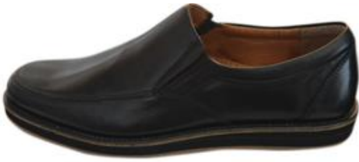
Fig.3: complete diabetic shoes.