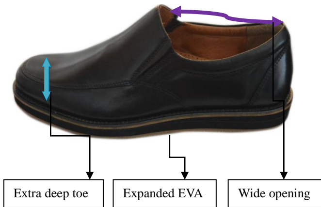
Fig.3: Design construction for diabetic shoe.

A more good advantage is obtained from diabetic shoe rather than the normal shoe for the diabetic patients. The following features added that will differ from normal Footwear and it is much more beneficial for diabetic Patients more than normal Footwear. The diabetic shoe has minimized frictional and uneven weight distribution. It is comfortable & has good gripping. It is a wide, roomy toe box to prevent the toes from being cramped. The sufficient space for toes prevents their deforming and local pressing[5]. It will reduce the different deformities of foot such as ulceration and amputation risk etc. To reduce the rubbing on the foot, seamless lining, made of soft fabric are used. Cushioning sole, with a true Toe-Spring design softens the step and helps propel foot forward.