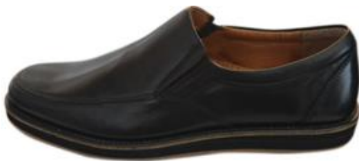
Fig.1: Working flow diagram.